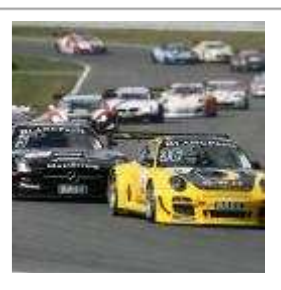
New starting time for ADAC GT Masters races: 12.15pm

Please click on the images for the print version.